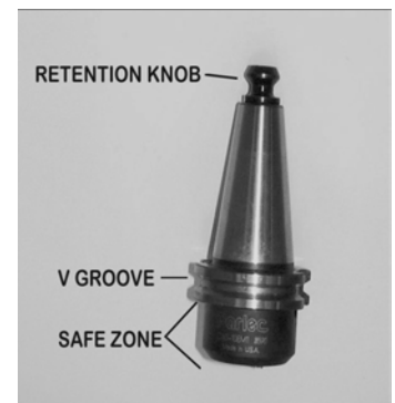
Figure 7-1 Spindle safe zone area.